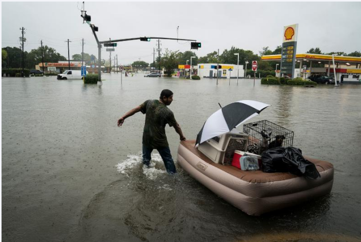
of Hurricane Harvey evacuee.