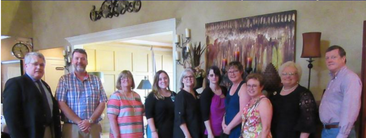
Partners and Corporate Leaders set the pace at the 2017 Pacesetter Campaign luncheon.