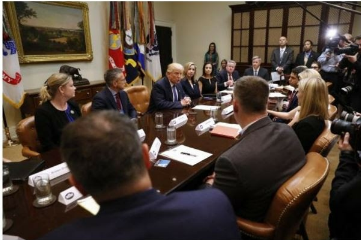
President Donald Trump speaks during a meeting on domestic and international human trafficking, Thursday, Feb. 23, 2017, in the Roosevelt Room of the White House in Washington.